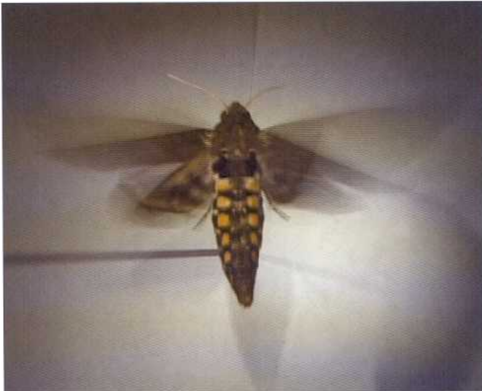
The hawkmoth Manduca sexta inhabits the night skies of the central and southern United States, flying at speeds up to 40 miles per hour and hovering above flowers to sip their nectar.

Key to collecting these data is Willows' use of an array of silicon electrodes actually etched onto the back of the computer chip by Böhringer, rather than piercing cells with traditional glass electrodes. This way, the entire chip with the electrodes can be fixed in place and the animal can be released into the ocean to interact with predators, prey,